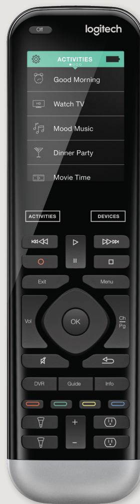
Logitech Harmony Pro