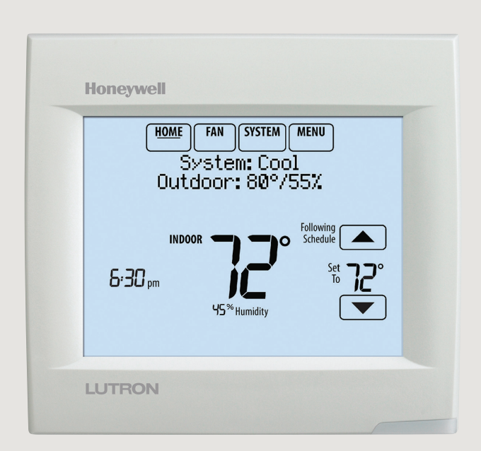
Lutron-Honeywell Wireless Thermostat