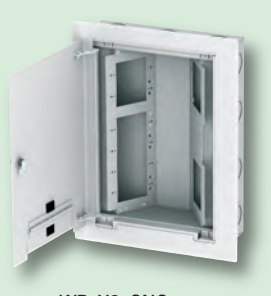
WB-X3-GNG Interior view