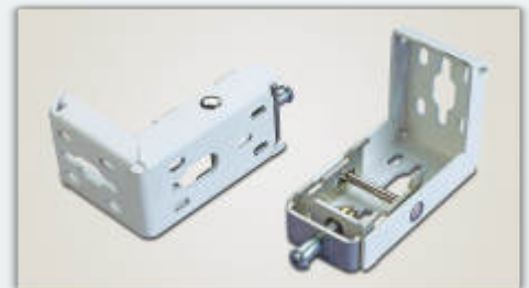
Locking mounting brackets allow either wall or ceiling installation.