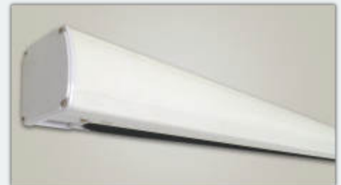
White, durable all-aluminum case houses a high-performance, ultra-quiet motor.

Note: The most common sizes and aspect ratios are listed here. Visit severtsonscreens.com/model/OE for more available sizes and specifications.