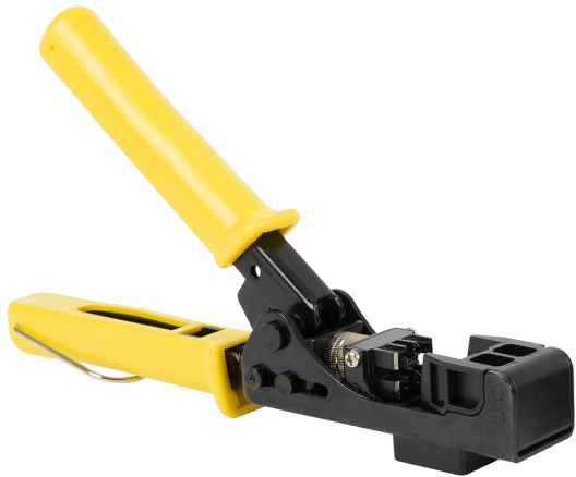
CAT 6a 90deg

WP-TOOL-RJ45-90-6/WP-TOOL-RJ45-90-6A/WP-TOOL-RJ45-180