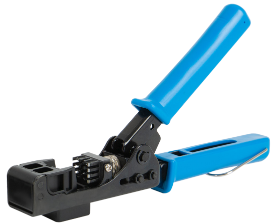
Cat 5e/6 90deg