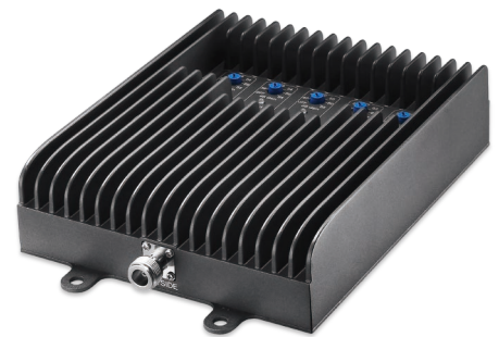
SureCall Fusion5s-CA Booster