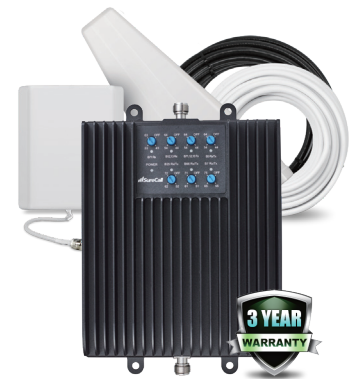
Shown: Fusion Professional 2.0 signal booster kit

SURECALL IS THE FIRST TO SUPPORT 8 BANDS: Double the boosted spectrum when compared to the closest competitor with three additional frequency bands: 600 MHz (Rural 5G); AWS-3 (Urban 5G) and 2600 (Urban High Capacity).