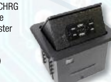
TB-CHRG "TILT 'N SELECT" TABLE BOX